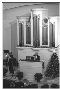
Old Salem Museums and Gardens

Wednesday, June 10 - Friday, June 12, 2009