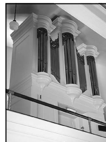
Hebron Lutheran Church